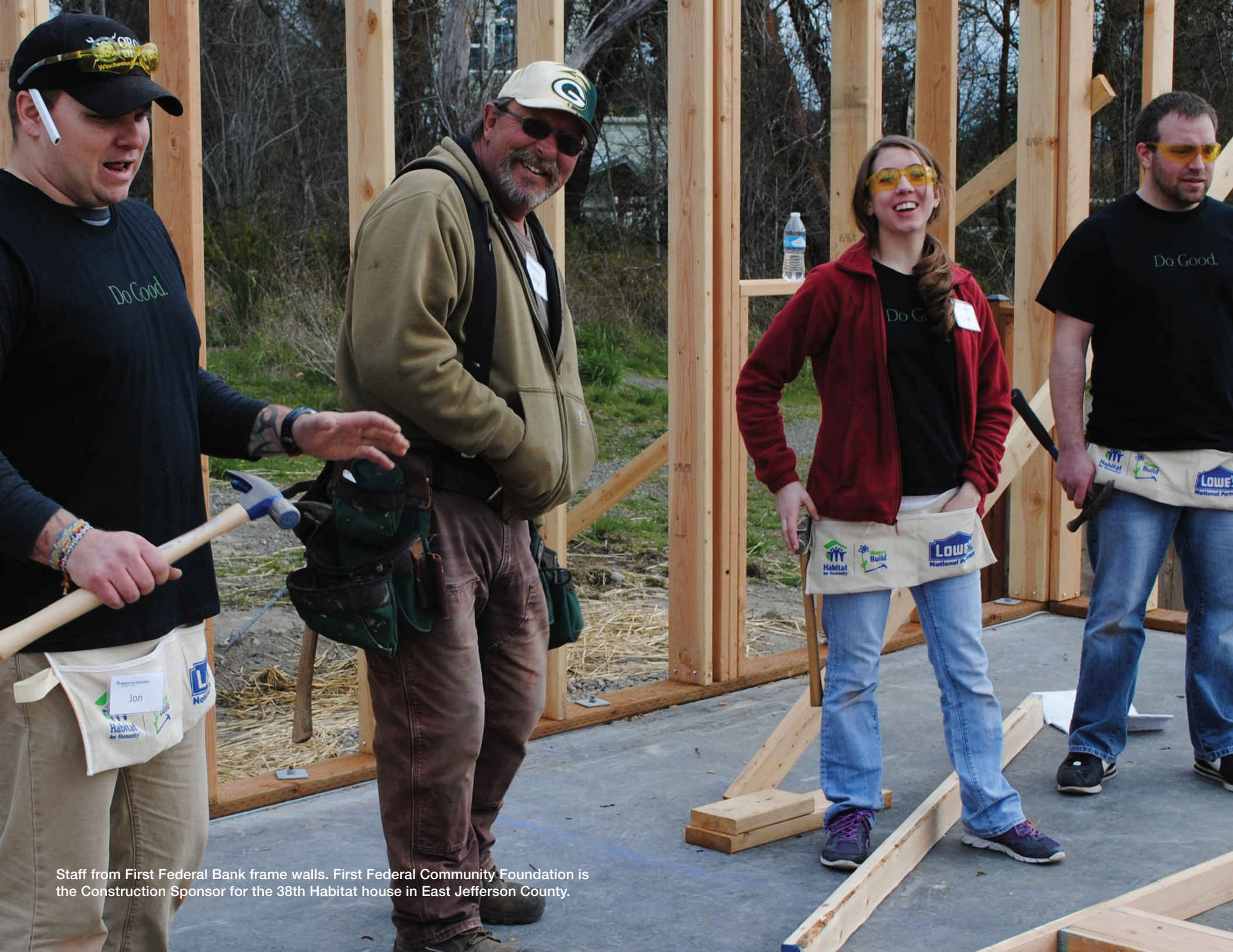
Staff from First Federal Bank frame walls. First Federal Community Foundation is the Construction Sponsor for the 38th Habitat house in East Jefferson County.