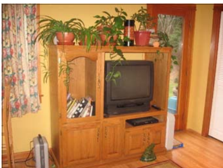
Wall unit from Furniture and More Store

When a hot water heater blew and ruined the furniture in her fam-